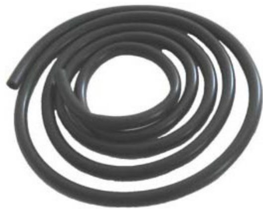
Tube V-1104- Tube, 10' long, black, 5/8 OD, 3/8 ID 10,