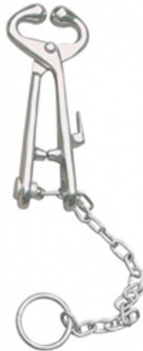
Bull Holder With Chain V-4002 Bull Holder With Chain