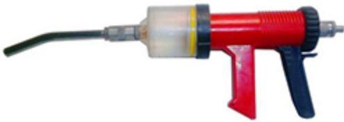
Automatic Drencher 150ml V-4404