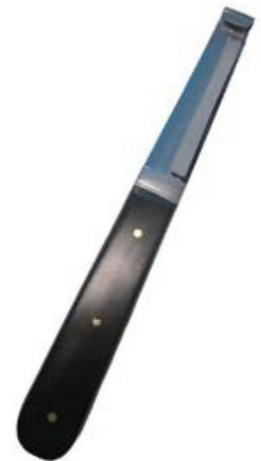
Superior wide blade - double edge 5/8 V-2106-

Right hand hoof knife of superior quality with a narrow blade 3/8". Bakelite handles, stainless steel.