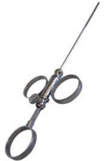
Teat Slitter - Single blade V-1209-