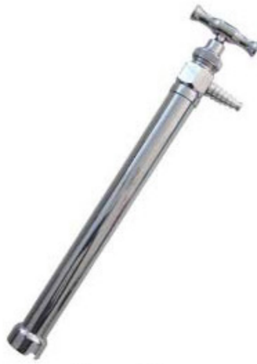
Stomach Pump V-1102- 17" long, Brass, chrome plated 17,