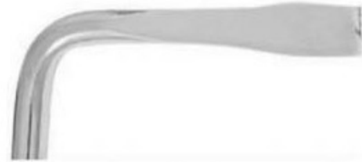
Sets With Carry Cases V-6103

Long Head Dental Pick Set of 3 Multifunctional picks are useful for elevating tissues around molar teeth. Helpful in lifting caps and removal of food between teeth. Manufactured from premium stainless steel and neoprene handles for slide free grip.