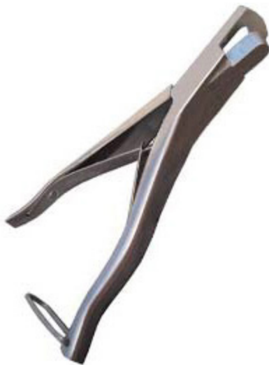
U type Stainless V-1304-

1/2" (12mm) V notch at base, medium 7" long, stainless steel 1/2,