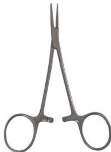
Halstead Mosquito - Straight V-2806- Stainless steel, straight, 5"