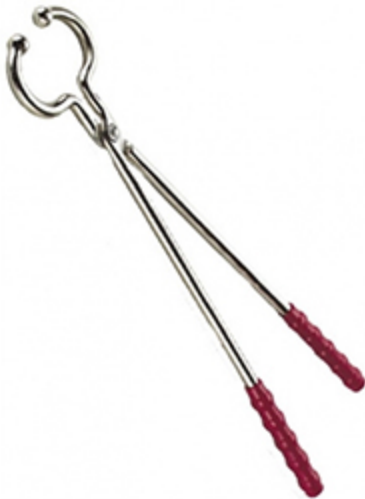
Bull Nose Tweezers 17" V-4004 Bull Nose Tweezers 17" 17" ,