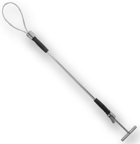
Pig Holder With Rubber V-4704