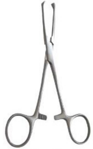
Allis Tissue Forceps V-2903-

32-086 3 1/2" long shaft 32-087 5 1/2" long shaft 32-088 8" long shaft 32-089 12" long shaft