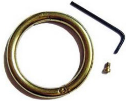
Bull Ring - Brass - Medium 3" X 3/8" v-2608

Bull Ring - Brass - Small 2 1/2" X 5/16" Small 2 1/2" X 5/16",