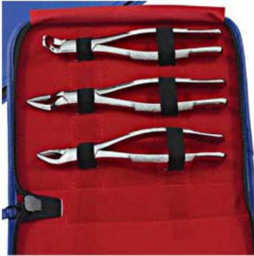
Sets With Carry Cases V-6101

7" Forceps Set of 3 Set Includes: Three different 7" fine quality forceps with knurled grip highly recommended for removal, extraction of wolf tooth and incisor caps.