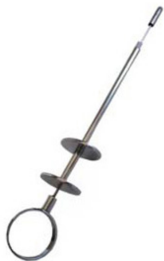
Hug's Teat Tumor Extractor V-1201- Chrome plated, 7" long 7,