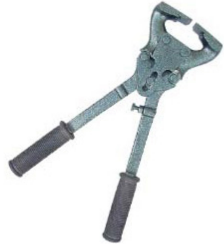
Hoof Trimmer v-2002

Heavy duty compound action hoof shears for horse and cattle with comfortable rubber handles.