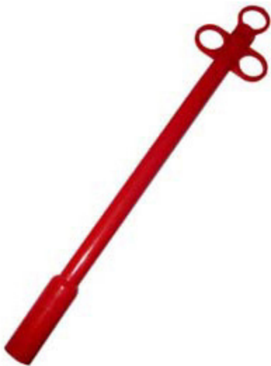
Plastic Balling Gun - Cow Size V-1010-