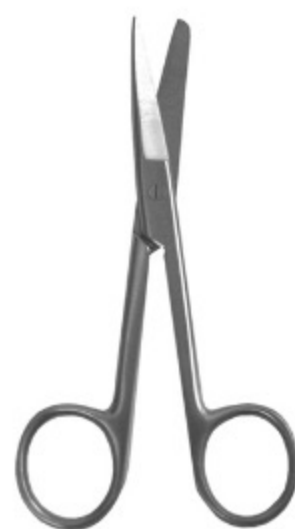
Operating Scissors - Curved Sharp/Blunt V-2821- Stainless steel, curved, 5 1/2"