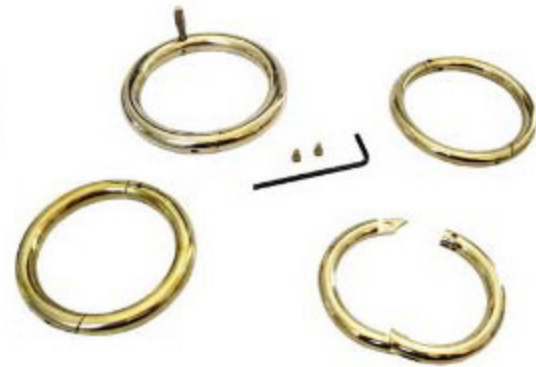
Brass ring V-2603- 5/16" x 3" ,