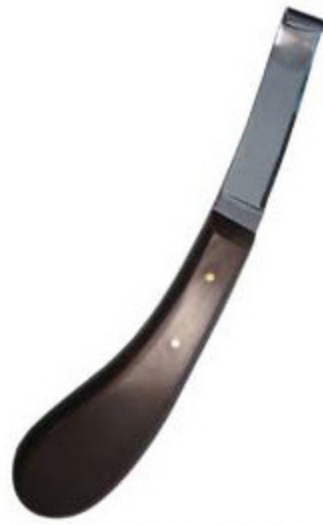
Superior wide blade - right hand 5/8 V-2108-

Left hand hoof knife of superior quality with a 5/8" wide blade. Bakelite handles, stainless steel.