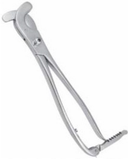
Sand s Castration Clamp 12.5" V-4101 Sand s Castration Clamp 12.5" 12.5" ,