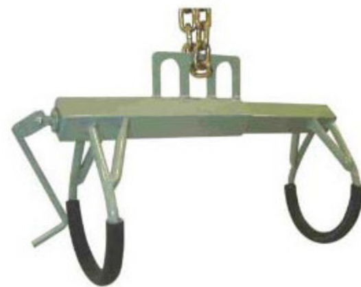
Rear Hiplift V-3906

Front End Sling is recommended for use with the Hip Lifter especially in cases where the cow cannot support her front quarters. Use of the Hip Lifter alone could result in tissue damage. Front End Sling is adjustable for