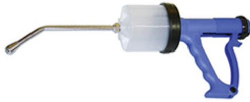
Drencher 300 ml V-4408