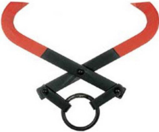
Beam Hook V-3901

Beam Hook opens a full 10" to serve as a speedy, movable support for a sling or winch. Modern design features curved, pointed ends which easily grip overhead beam, tree limb, or pipe. The more pressure applied, the better the grip. The beam hook is a valuable companion piece to the Cow Lift. Load limit 1500 lbs.