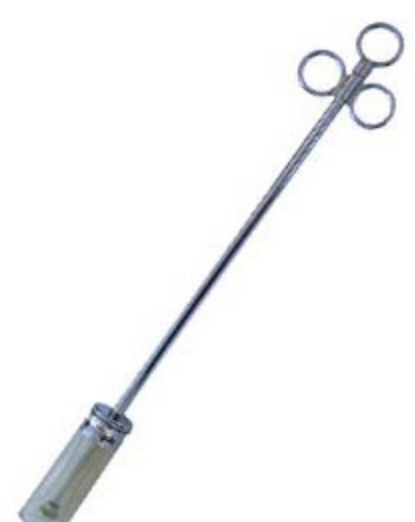
Plastic head V-1006-

18" long, w/ spring, 5/8" metal head, carbon steel 5/8,18,