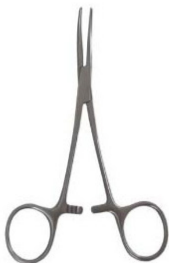
Crile Hemostat - Curved V-2801- Stainless steel, curved, 6"