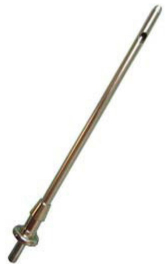
Infusion Tubes - 3 V-1205- Pointed tip, 3" long