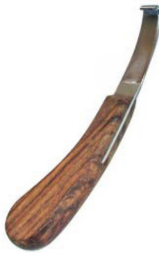
Wide blade - left hand 5/8 V-2111-

Double edge hoof knife with a 5/8" wide blade, stainless steel.