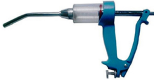
Automatic Drencher (60ml) V-4402