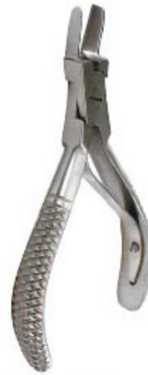
Pig Tooth Nippers V-3202- 5" long, stainless steel 5",