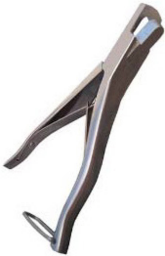
U type Stainless V-1301-

1/2" (12mm) U notch at base, medium 7" long, stainless steel 1/2,