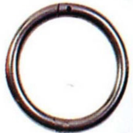
Bull Rings v-2606 Bull Ring - Stainless - 3" 3" ,