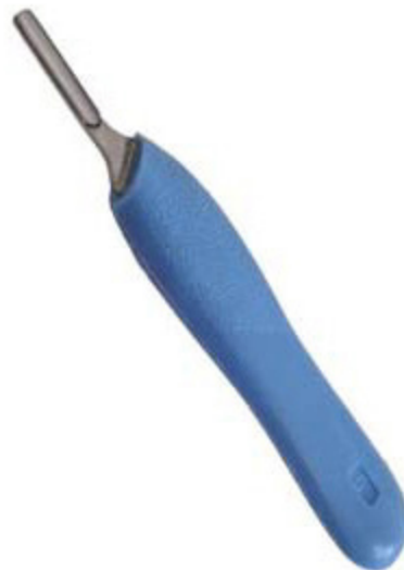
Scalpel Handle - Plastic grip V-2705-

Stainless steel, w/ plastic grip, reusable