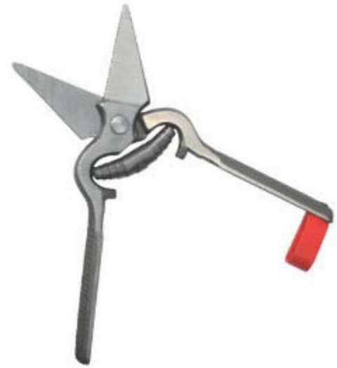
9 1/2" Long - Burdizzo type V-1802-