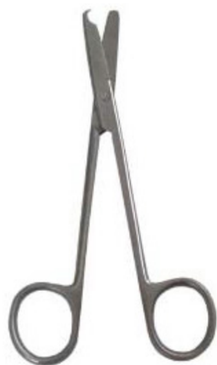
Littauer Stitch V-2813- Stainless steel, 5 1/2"