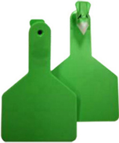
Ear Tag V-4501