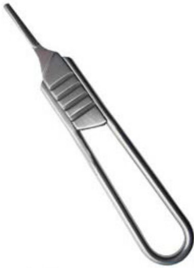
Folding scalpel handle V-2701-

Stainless steel 32-293 Leather sheath for folding handle