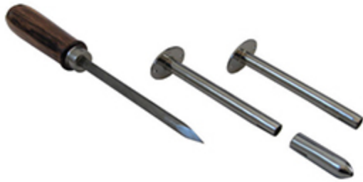
Trocar V-3301- Trocar w/ two cannula, stainless steel, 5 1/2" long