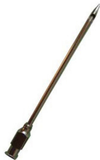
Infusion Tubes - 2.5 V-1203- Pointed tip, 2 1/2" long