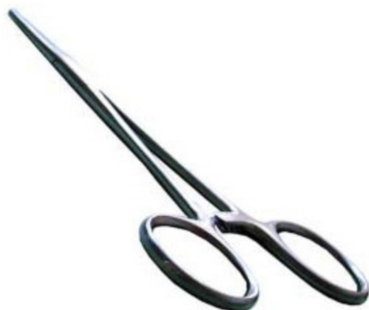
Artery forceps - straight V-3702-