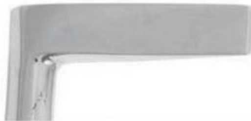
Sets With Carry Cases V-6108