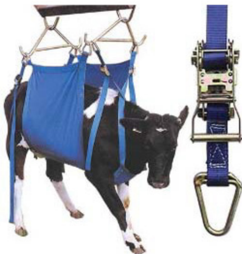
XL Daisy Heavy Duty Cow Lifter V-3904

New improved Daisy Lifter Cow Lift is a simple and inexpensive way to lift or move cows with a front end loader or bucket. Gentle lifting with support from the backside to the brisket, ensures that the cow is not