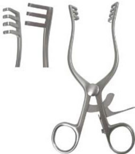
Weitlaner Retractor V-3004- 7",