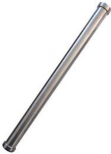
Frick Speculum V-1101- 20" long 20,