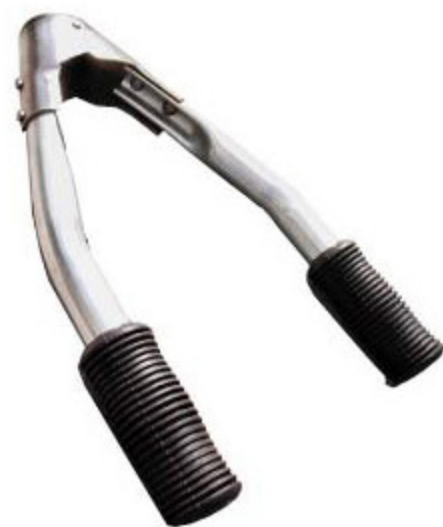
Barnes Dehorner V-3703-

32-850 13" long 32-851 17" long 20-848 13" long superior 20-849 17" long superior