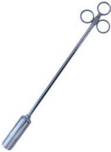
Metal head V-1001-

18" long, w/ spring, 1" metal head, carbon steel 1",18",