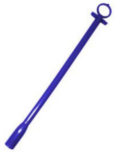
Plastic Balling Gun - Calf Size V-1009-