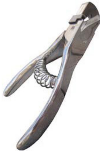
V type Aluminum V-1302-

1/2" (12mm) U notch at base, medium 7" long, stainless steel 1/2,