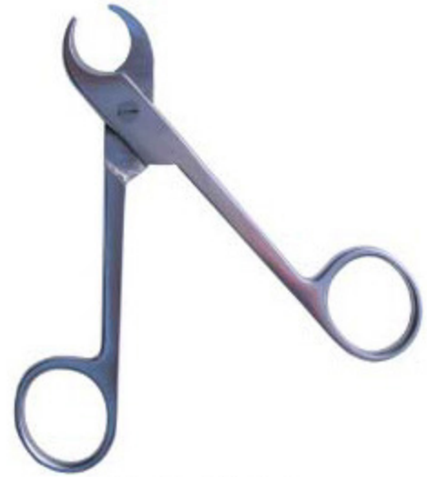
White Toe Nail Scissors V-1902-

Economy stainless steel clippers with non-slip handles. Minimum effort for clean and smooth cut.