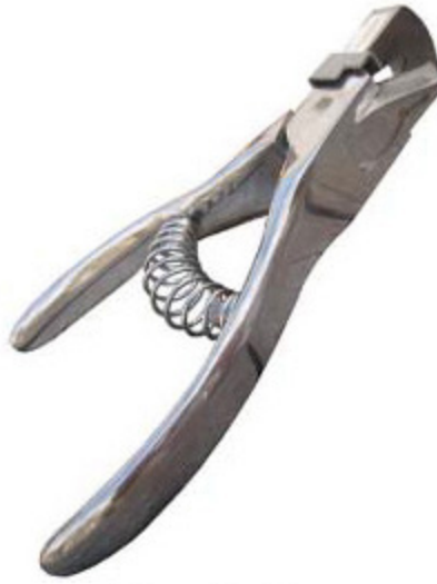
V type Aluminum V-1308-

5/16" (8mm) U notch at base, small 6" long, stainless steel 5/16,