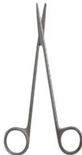
Metzenbaum Scissors - Curved V-2818- Stainless steel, curved, 7"