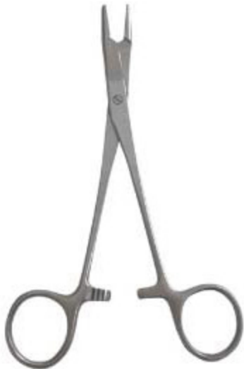
Olsen-Hegar Needle Holder V-3404- Stainless steel. 6 1/2",