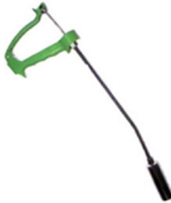
Bolus Gun Large Curved V-4302