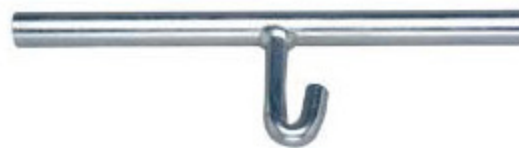
OB T-Bar Handle V-3805

Hook, nickel finish, is designed to grasp chain firmly at any length.