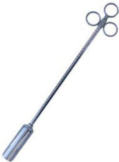
Metal head V-1004-

18" long, no spring, 1" plastic head 1,18,