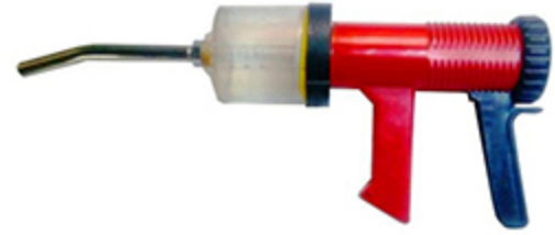
Semi Auto 150ml V-4409