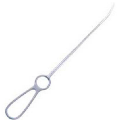
Bhuner Needle v-4206