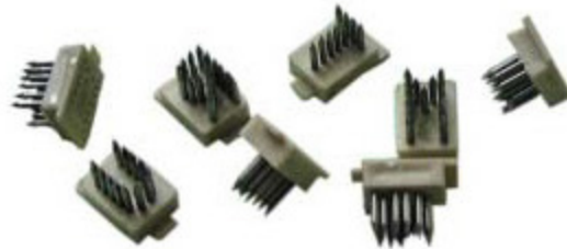
Set of Letters V-1402-

Green & black tattoo ink. large variety of containers available for ink or provide one and we'll fill it!!