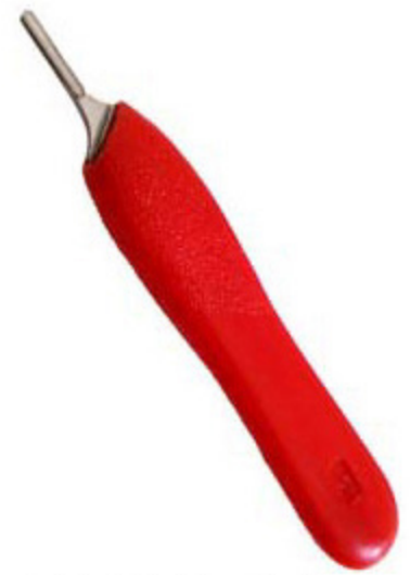
Scalpel Handle - Plastic grip V-2703-

Stainless steel, w/ plastic grip, reusable