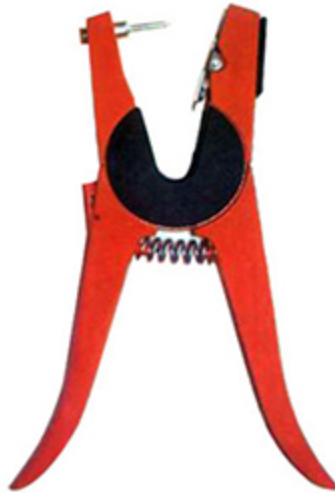
Ear Tag Plier (size 9.5") V-4502