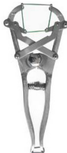
Band Castrator V-3606-