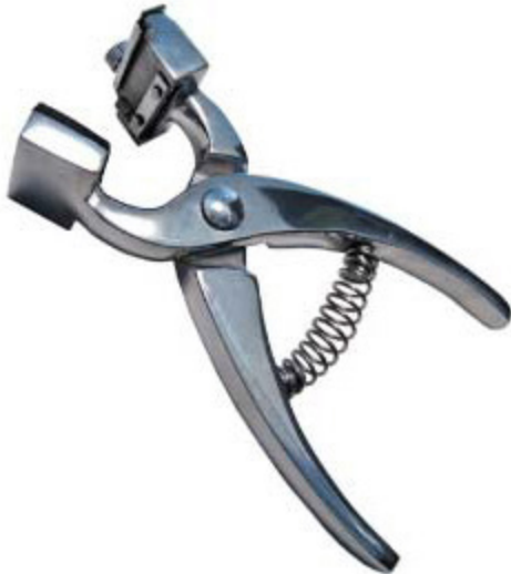
Small Tattoo Pliers V-1404-

31-027 3/8" 0 - 9 fits small pliers 31-029 5/16" 0 - 9 fits standard pliers