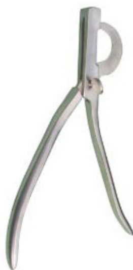
Extra crushing area V-3602-

12", w/extra crushing area, stainless steel