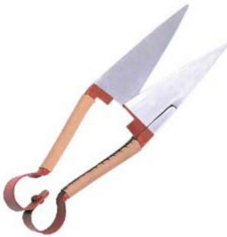
Sheep Shears v-1604 Sheep Shears