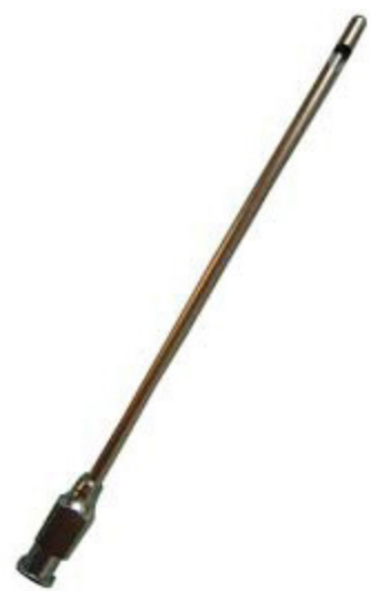
Infusion Tubes - 3 1/2 V-1204- Rounded tip, stainless steel canula, brass chrome plated hub, two side opening, 3 1/2"long