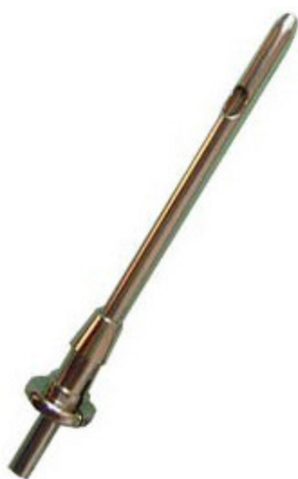
Infusion Tubes - 2 1/2 V-1202- Rounded tip, stainless steel canula, brass chrome plated hub, two side opening, 2 1/2"long