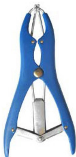
Band Castrator - Blue V-3607-