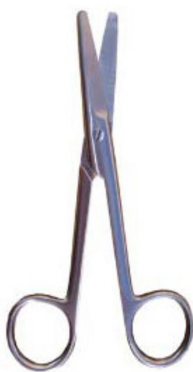
Operating Scissors - Curved Blunt V-2820- Stainless steel, curved, 5 1/2"