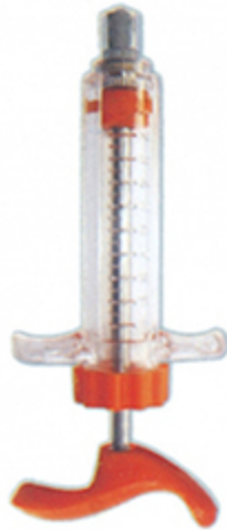
BD syringe 10,20,30,50ml V-4802