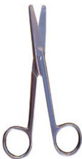
Operating Scissors - Straight Blunt/Blunt V-2823- Stainless steel, blunt/blunt, straight, 5 1/2"