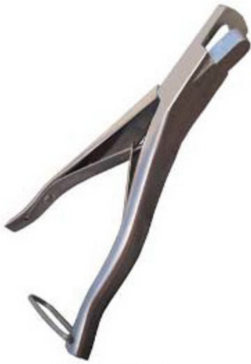
U type Stainless V-1307-

5/16" (8mm) U notch at base, small 6" long, stainless steel 5/16,