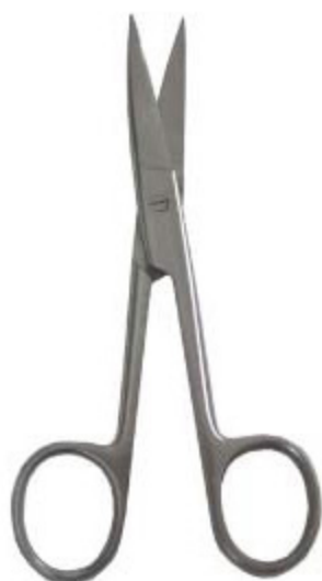
Operating Scissors - Curved Sharp/Sharp V-2822- Stainless steel, curved, 5 1/2"