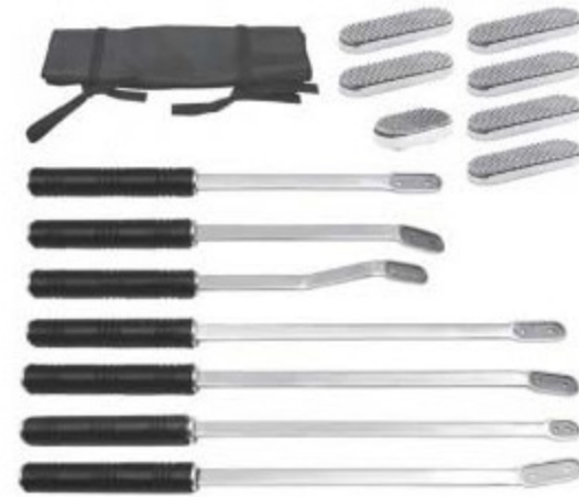
Float Kit V-6003

Classic Round Shaft Float Kit Complete Kit includes float SH1, SH2, SH3, SH4, SH5, SH6 and 6 corresponding blades to fit in package floats. FREE DELIVERY ON THIS PACKAGE.