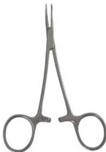
Halstead Mosquito - Curved V-2805- Stainless steel, curved, 5"