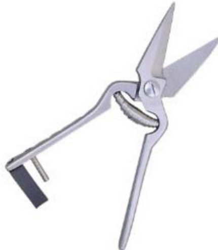
Sheep Shears v-1605 Sheep Shears