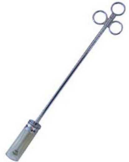
Plastic head (no spring) V-1003-

18" long, w/ spring, 1" plastic head 1,18,