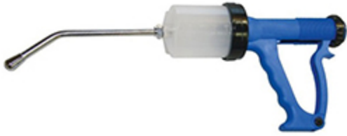
Drencher 200 ml V-4407