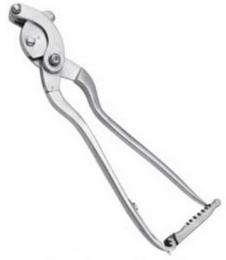
Serra Emasculator 14" V-4103 Serra Emasculator 14" 14" ,