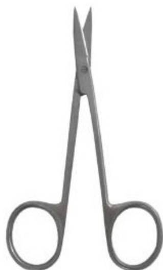
Iris Scissors - Straight V-2808-