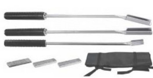
Float Kit V-6001

Basic Float Kit Kit includes float SH1, SH5, No 26 and 3 corresponding blades to fit in package floats. you also have an option to select any 3 floats from our range and the price will be charged at £270.00