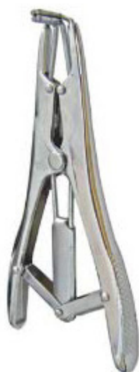
Band Castrator - Composite V-3608-