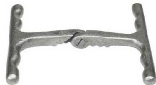
Wire Saw V-3806

Easy grip two-handed pull design provides extra leverage. Hook will not spring or let chain slip.