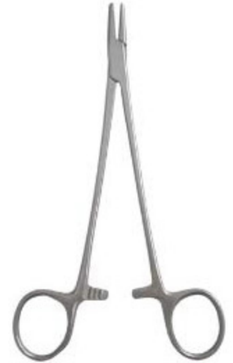
Mayo-Hegar Needle Holder V-3403- Stainless steel. 7",