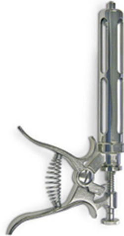
Multi Dose Syringe V-4808