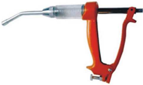
automatic drencher (30ml) V-4401