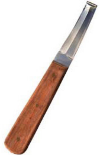
Wide blade - double edge 5/8 V-2110-

Double edge hoof knife with a 5/8" wide blade, stainless steel.