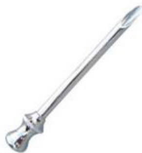
Milking Tube v-4205