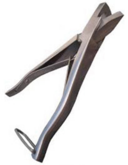
V type Stainless V-1309-

Small 5" long, die cast aluminum, 5/16" (8mm) V notch at base 5/16,