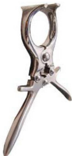
Lambs & piglets V-3604-