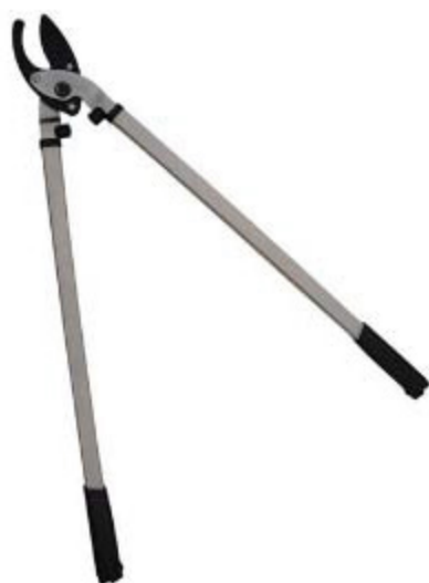
Dehorner pliers - Aluminum V-3704-

32-850 13" long 32-851 17" long 20-848 13" long superior 20-849 17" long superior