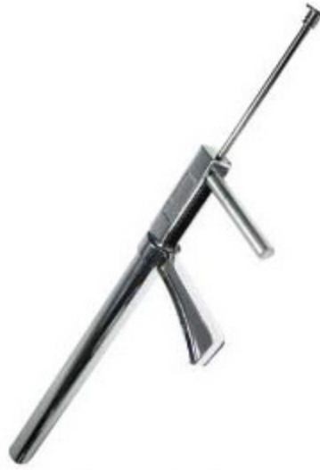
Multi-bolus Balling Gun V-1008-

18" long, no spring, 5/8" plastic head 5/8, 18,