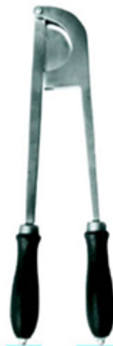
Tail Cutter v-3305