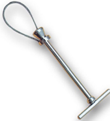
Pig Holder (small) V-4507