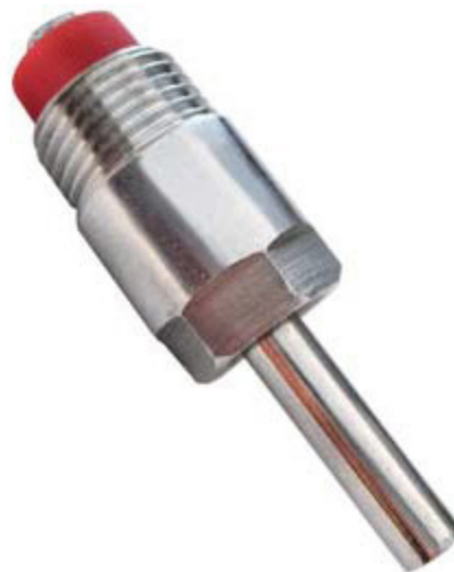
Wet Hex S.S. Long pin V-1511-

WET, HEX, stainless steel, thick pin, 1/2" thread