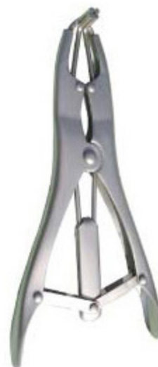
Band Castrator - Stainless Steel V-3609-