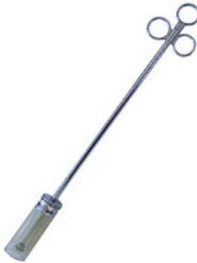
Plastic head V-1002-

18" long, w/ spring, 1" metal head, carbon steel 1",18",