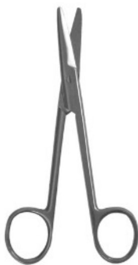
Mayo Scissors - Curved V-2814- Stainless steel, curved, 5 1/2"