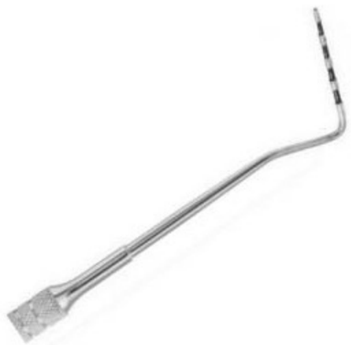
Sets With Carry Cases V-6110