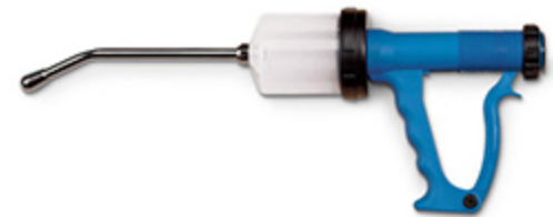
Drencher 200 ml V-4406