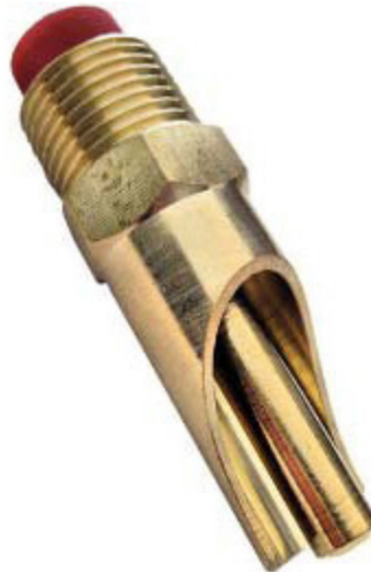
Hex Brass V-1505-

FLAT, stainless steel, piglet, 1/2" thread