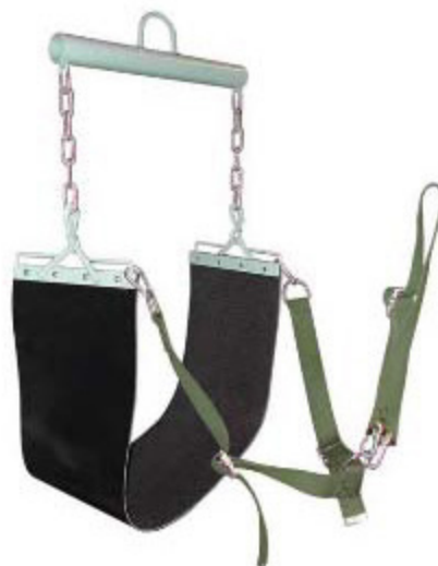
Front End Sling V-3905

New improved Daisy Lifter Cow Lift is a simple and inexpensive way to lift or move cows with a front end loader or bucket. Gentle lifting with support from the backside to the brisket, ensures that the cow is not