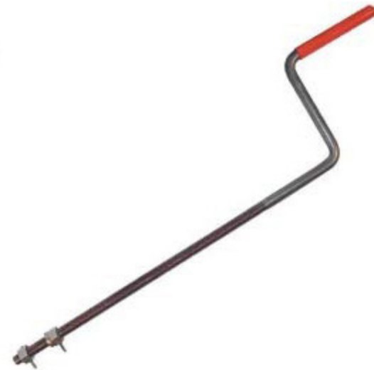
Crank Handle f/ Cow Lift V-3903

Economical and durable, the improved Nordic Cow Lift is simple to use. Lightweight and self-locking, the lift tightens with a simple hand crank. Useful for everything from post-parturient paresis, down cow, and prolapsed uterus to surgery restraint, generalized weakness, obturator paralysis or fracture repair. The self-locking rings will not slip outward as you jack them inward. Wt. 19 lbs.