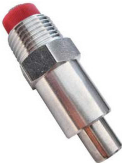
Hex S.S. Thick pin V-1510-

HEX, stainless steel, piglet, narrow, 1/2" thread