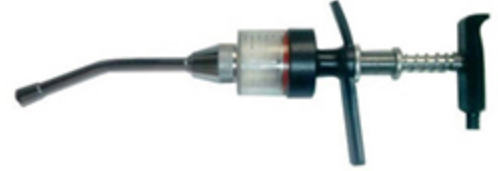
Automatic Drencher 30ml V-4403