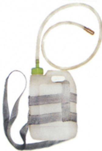
Calf Feeder V-4405