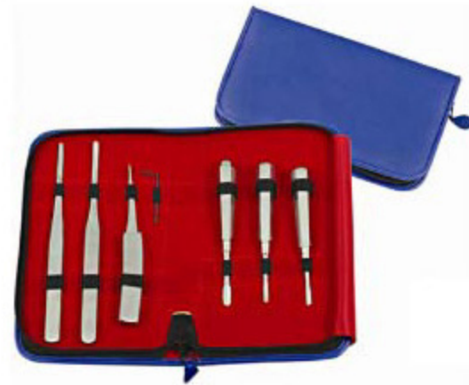
Sets With Carry Cases V-6115