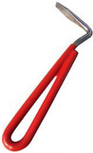
Hoof Pick V-2101-