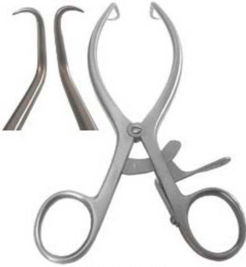
Gelpi Retractor V-3001- 7",