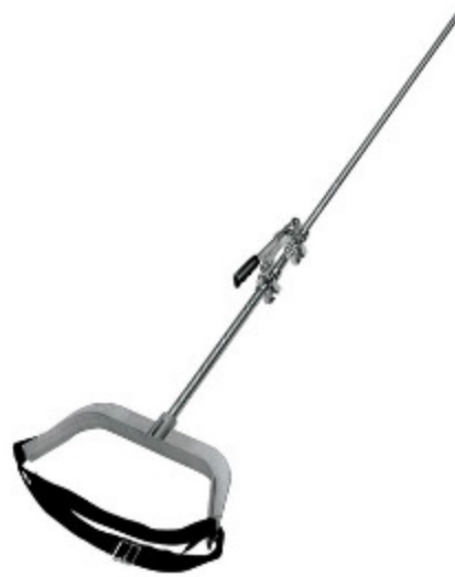
Ratch-a-Pull Dual Action V-3802

(Neogen) Popular, dependable calf puller has stood the test of time. The cam jack moves easily on smooth shaft. Tension is released with the press of a lever. Has wide cast aluminum breechen, and two section shaft that can be disassembled for easy storage. 45" OB chain included.