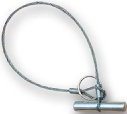
Pig Holder (30cm) V-4701