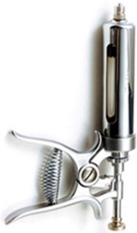
Multi Dose Syringe V-4807