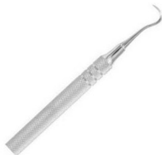
Sets With Carry Cases V-6112