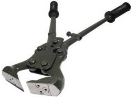
Heavy Duty V-2001-

Heavy duty compound action hoof shears for horse and cattle with comfortable rubber handles.