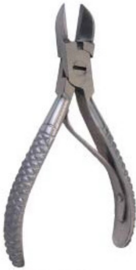
Pig Tooth Nippers V-3201- 5 1/2" long, stainless steel 5 1/2",