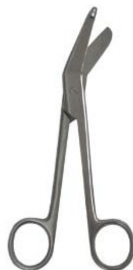
Lister Bandage Scissors V-2812-