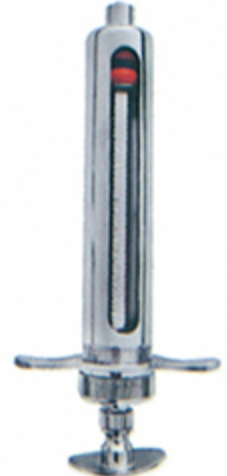
Metal Syringe Luer Lock Inner Graduated rod (10,20,30,50 ml) V-4806