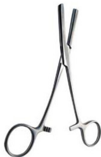
Ferguson Angiotribe - Curved V-2803- Stainless steel, curved, 6 1/2"