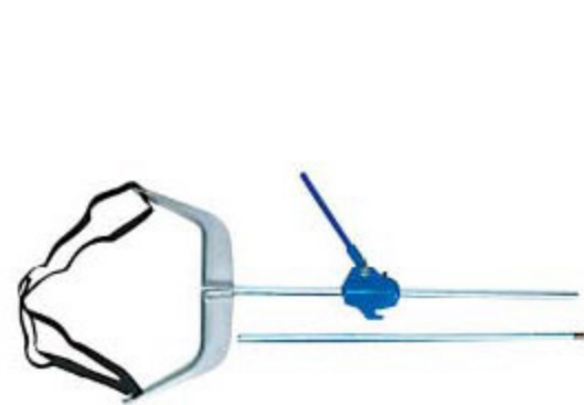
Calf Puller 45" V-3801

(Neogen) Popular, dependable calf puller has stood the test of time. The cam jack moves easily on smooth shaft. Tension is released with the press of a lever. Has wide cast aluminum breechen, and two section shaft that can be disassembled for easy storage. 45" OB chain included.