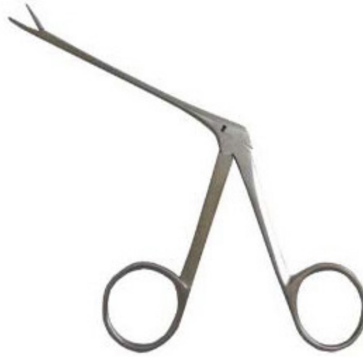
Alligator Forceps V-2902-

32-576 4 1/2" long smooth 32-577 4 1/2" long 1 x 2 teeth 32-081 4 1/2" long 7 x 8 teeth