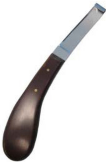
Superior narrow blade - left hand 3/8 V-2104-

Right hand hoof knife with a narrow blade 3/8", stainless steel.