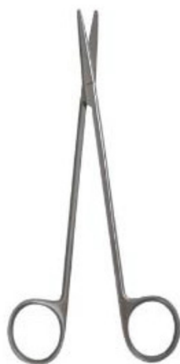
Metzenbaum Scissors - Straight V-2819- Stainless steel, straight, 7"