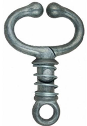
Bull Leader V-4003 Bull Leader