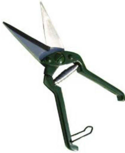
9 1/2 V-1801-