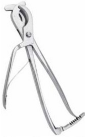
Reimer s Emasculator 13" V-4102 Reimer s Emasculator 13" 13" ,