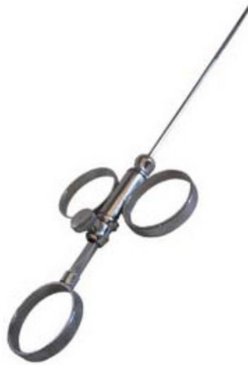
Teat Slitter - Double blade V-1208-

Two side opening, 3 1/2" long, adjustable, stainless steel