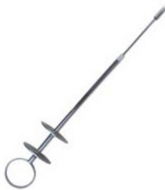
Teat tumor Extractor v-4202