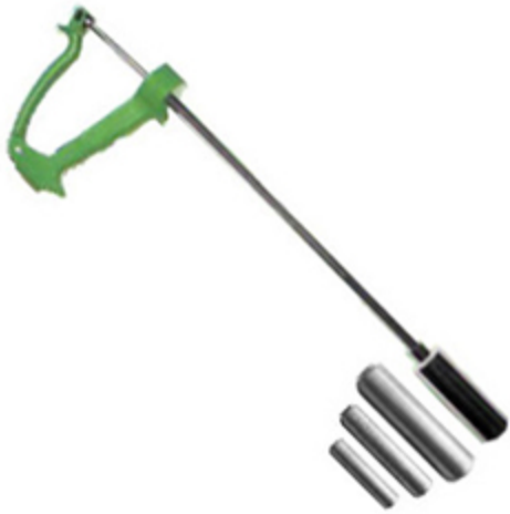
Bolus Applicator Straight V-4301