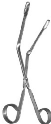
British Capsule Forceps V-2905-