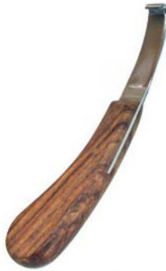
Narrow blade - left hand 3/8 V-2102-

Wooden handles, 3/8" narrow blade, left curved blade, stainless steel.