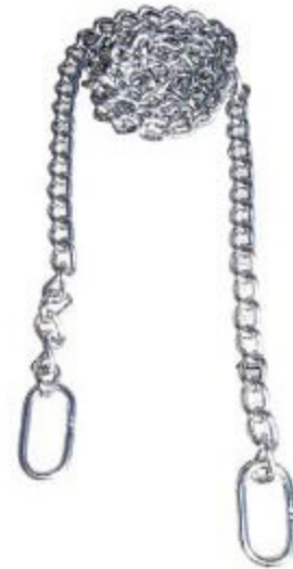
O.B. Chain V-2402-

32-780 30" long 76 cm 32-783 45" long 115 cm 32-781 60" long 150 cm