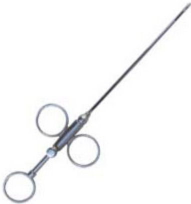
Teat Slitter v-4201