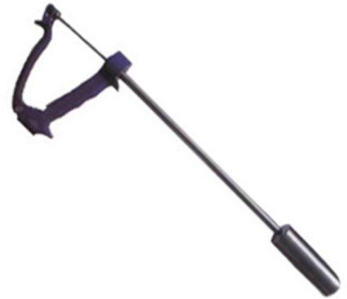
Bolus Gun Large Straight XL V-4303