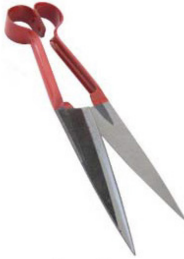
Sheep Shears V-1602- 6 1/2" long, red handle 6 1/2",