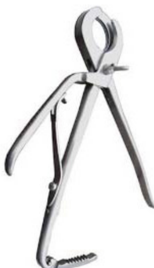
Reimer Emasculator V-3611-