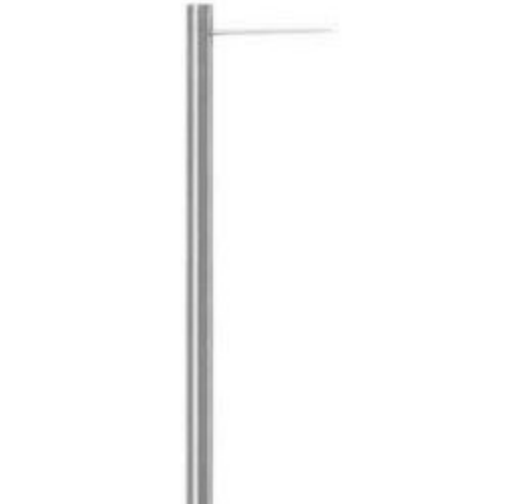
Sets With Carry Cases V-6111