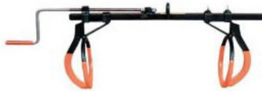
Cow Lift V-3902

Beam Hook opens a full 10" to serve as a speedy, movable support for a sling or winch. Modern design features curved, pointed ends which easily grip overhead beam, tree limb, or pipe. The more pressure applied, the better the grip. The beam hook is a valuable companion piece to the Cow Lift. Load limit 1500 lbs.