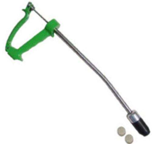
Sheep Calfmin Double Bolus Applicator V-4306