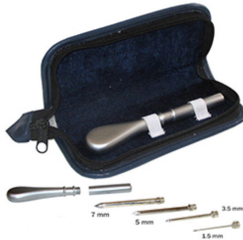
Trocar Kit V-3302- 4 sizes in one handle. 7mm diameter w/ cannula 5mm diameter w/ cannula 3.5mm w/ cannula 1.5mm w/ cannula