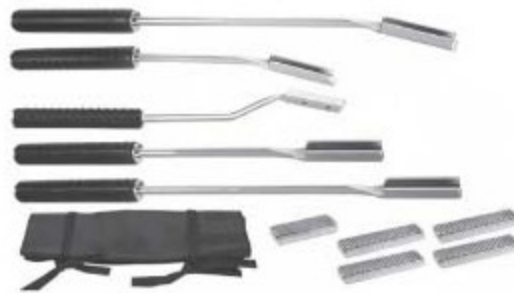
Float Kit V-6002

Basic Float Kit Kit includes float SH1, SH5, No 26 and 3 corresponding blades to fit in package floats. you also have an option to select any 3 floats from our range and the price will be charged at £270.00