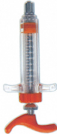
Inner graduated Rod, Transparents, Sterilizable 120 c, Unbreakable Plastic Barrel V-4805