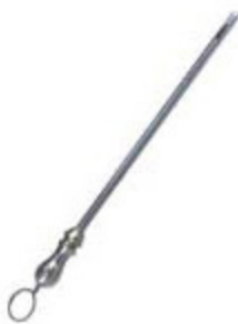
Milking Tube v-4204