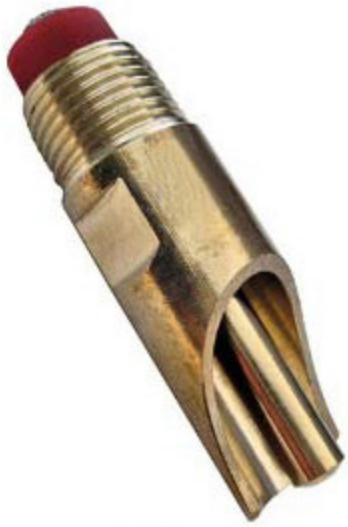
Flat Brass V-1501-