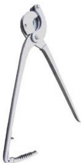
Serra Emasculator V-3613- Stainless steel 14",