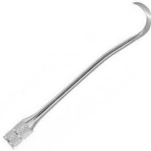
Sets With Carry Cases V-6114