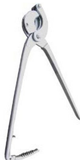
Serra Emasculator V-3612-