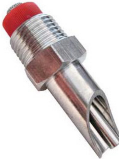
Hex S.S. Piglet V-1508-

HEX, stainless steel, piglet, 1/2" thread