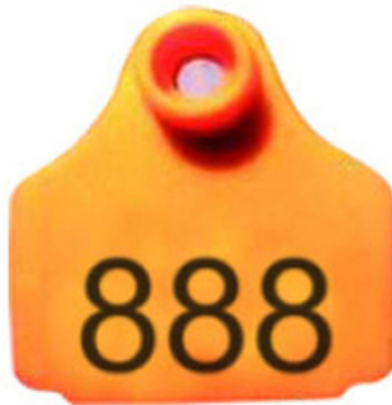
Ear Tag Printed (small) V-4505