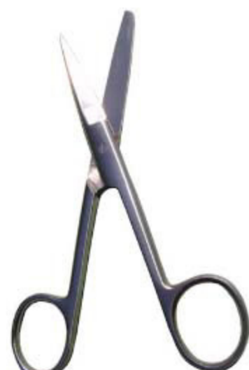
Operating Scissors - Straight Sharp/Blunt V-2824- Stainless steel, straight, 5 1/2"