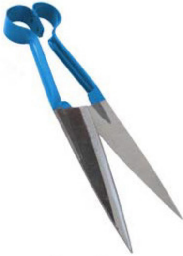
Sheep Shears V-1601- 5 1/2" long 5 1/2",