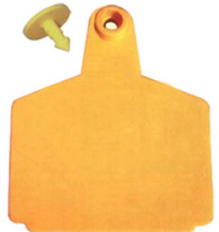
Ear Tag xl V-4506