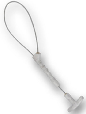
Pig Holder With Lock V-4703