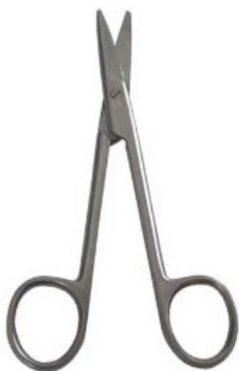
Mayo Scissors - Straight V-2816- Stainless steel, straight, 5 1/2"