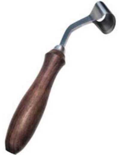
Swiss Knife V-2109-

Right hand hoof knife of superior quality with a 5/8" wide blade. Bakelite handles, stainless steel.