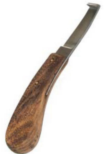
Wide blade - right hand 5/8 V-2112-

Left hand hoof knife with a 5/8" wide blade, stainless steel.