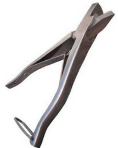
V type Stainless V-1306-

Large 9 1/2" long, die cast aluminum, 13/16" (20mm) V notch 13/16,