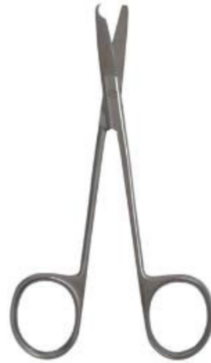
Spencer Stitch V-2826-

Stainless steel, sharp/sharp, straight, 5 1/2"