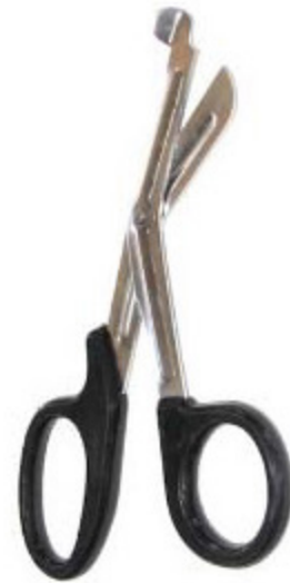
Economy V-3102- Long 7",