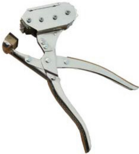
4 Digit Rotary tattoo plier V-1401-

Green & black tattoo ink. large variety of containers available for ink or provide one and we'll fill it!!