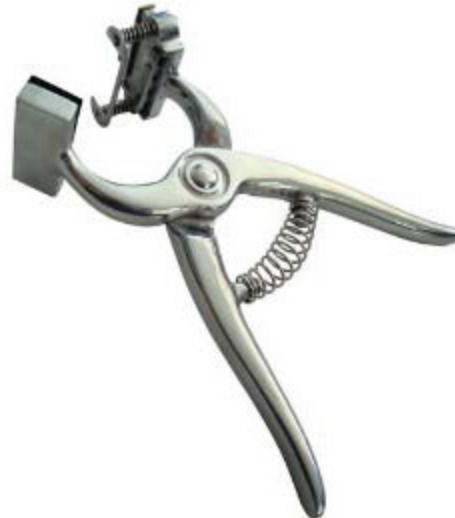
Standard Tattoo Pliers V-1405-

Holds up to five 5/16" digits. small, aluminum alloy