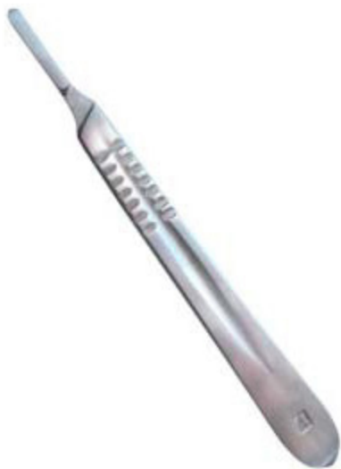
Scalpel Handle V-2704-

Stainless steel, w/ plastic grip, reusable