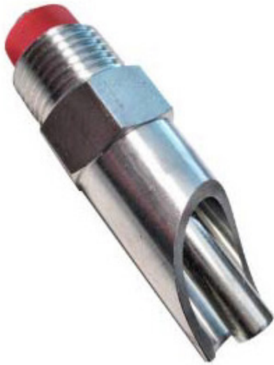
Hex S.S. V-1507-