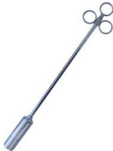
Metal head V-1005-

18" long, w/ spring, 1/2" metal head, carbon steel 1/2,18,