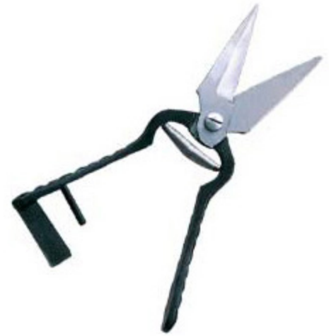
Sheep Shears v-1603 Sheep Shears