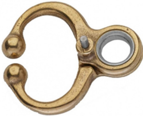
Brass Nose Leader V-4001 Brass Nose Leader