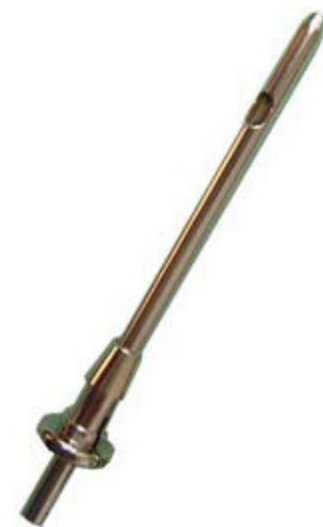
Milk Tubes - 2 1/2 V-1206- Two side opening, 2 1/2"long, adjustable, stainless steel cannula