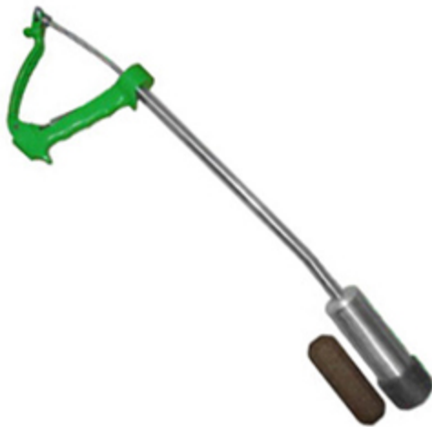
Large Bolus Applicator Curved V-4304