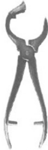
Ring Plier V-4007 Ring Plier