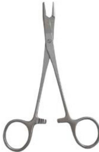
Olsen-Hegar Needle Holder V-3405- Stainless steel. 7",