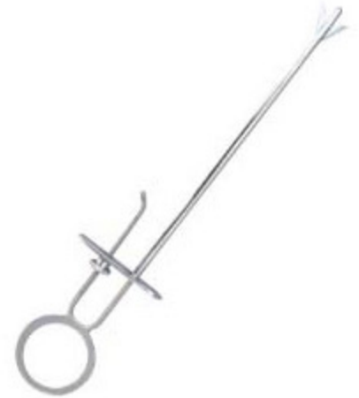
Danish teat Slitter v-4203