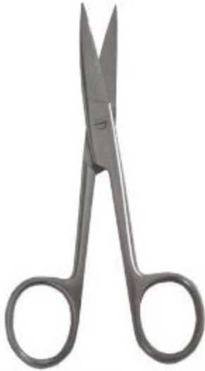
Operating Scissors - Straight Sharp/ Sharp V-2825-

Stainless steel, sharp/sharp, straight, 5 1/2"