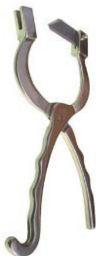
Newberry Castrator V-3610-