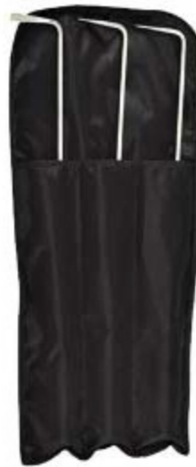
Sets With Carry Cases V-6102

7" Forceps Set of 3 Set Includes: Three different 7" fine quality forceps with knurled grip highly recommended for removal, extraction of wolf tooth and incisor caps.