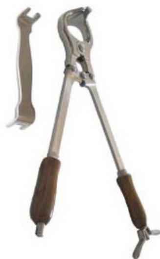
Mature horses & bulls V-3603-

12", w/extra crushing area, stainless steel