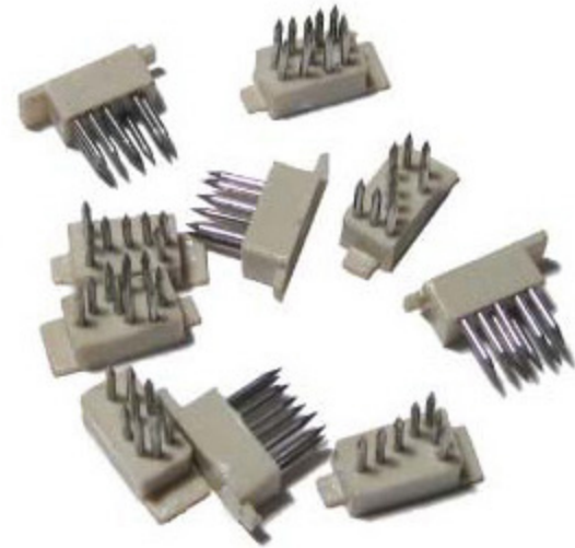
Set of Numbers V-1403-

31-028 3/8" A - Z fits small pliers 31-030 5/16" A - Z fits standard pliers