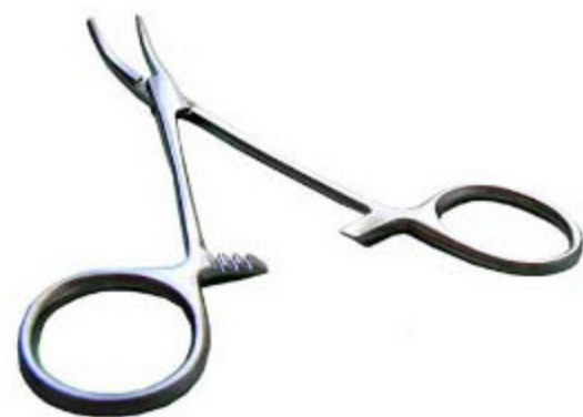
Artery forceps - curved V-3701-