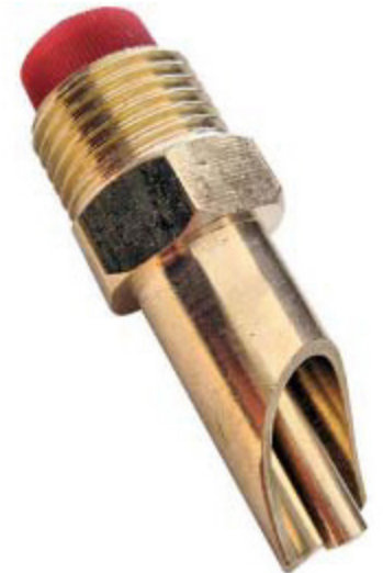
Hex Brass Piglet V-1506-