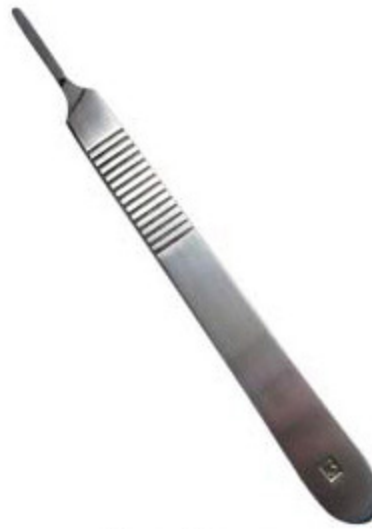
Scalpel Handle V-2702-

Stainless steel 32-293 Leather sheath for folding handle