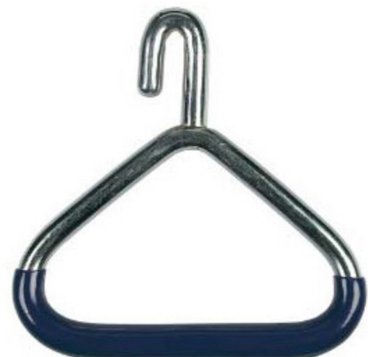
OB Handle V-3804

(Neogen) Features same rugged construction as Dr. Franks, but with 2 pulling points that alternately advance to shift the pull from one leg to the other to "ease" the calf out. Two-piece cam jack has special easy release feature. Two-piece smooth shaft and wide cast aluminum breechen. Lightweight special strength aluminum construction makes it easy to handle.