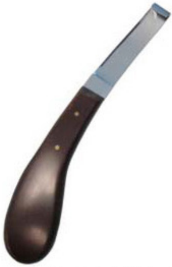
Superior wide blade - left hand 5/8 V-2107-

Left hand hoof knife of superior quality with a 5/8" wide blade. Bakelite handles, stainless steel.