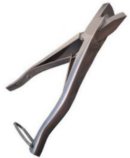
V type Stainless V-1303-

Medium 6 1/2" long, die cast aluminum, 1/2" (12mm) V notch 1/2,