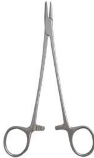
Mayo-Hegar Needle Holder V-3402- Stainless steel. 6",