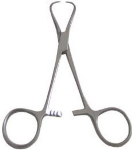
Backhaus Towel Clamp V-2904-