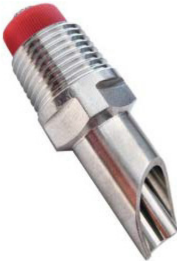
Flat S.S. Piglet V-1504-

FLAT, stainless steel, piglet, 1/2" thread