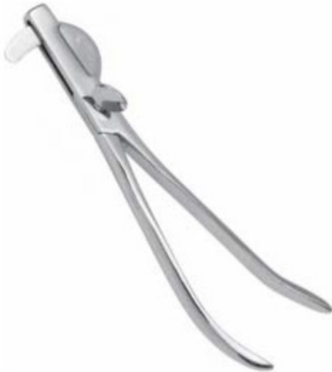
Verboeczy Emasculator 11" V-4104 Verboeczy Emasculator 11" 11" ,