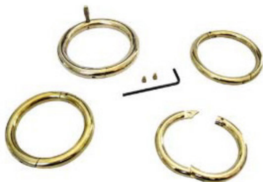
Brass ring V-2604- 7/16" x 3 1/2" ,