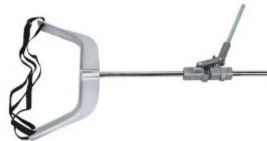
Calf EZE Dual Action Puller V-3803

New, improved model double action puller. Refined milled grooves on shaft with no sharp edges. Wide cast aluminum breech spanner and longer solid shaft for those big calves. Puller disassembles for storage. Heavy-duty construction throughout. Order OB chains separately.