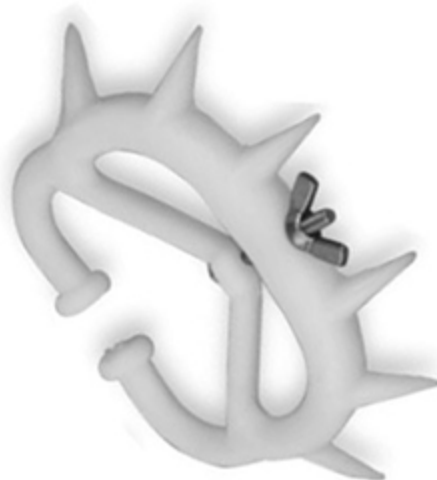
Plastic Milk Sucking Preventer 4602