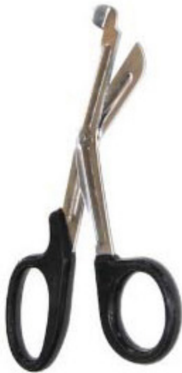
Universal scissors V-3101- Long 7",