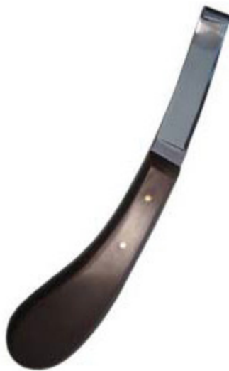
Superior narrow blade - right hand 3/8 V-2105-

Left hand hoof knife of superior quality with a narrow blade 3/8". Bakelite handle, stainless steel.