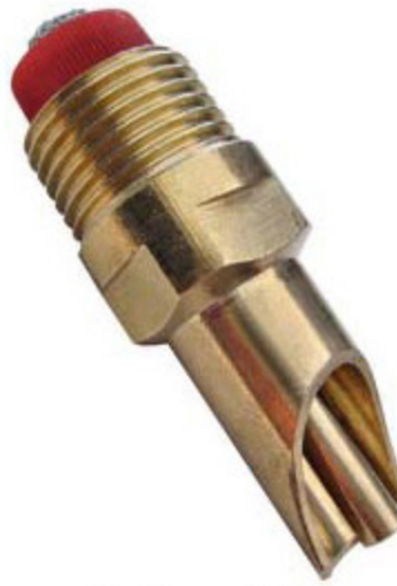
Flat Brass Piglet V-1502-