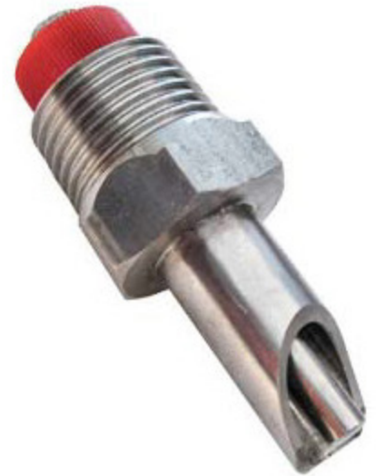
Hex S.S. Piglet Narrow V-1509-

HEX, stainless steel, piglet, 1/2" thread