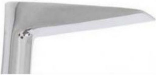
Sets With Carry Cases V-6107