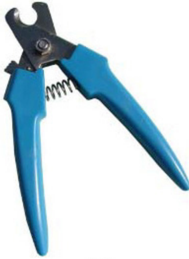
Dog nail clippers V-1901-

Economy stainless steel clippers with non-slip handles. Minimum effort for clean and smooth cut.