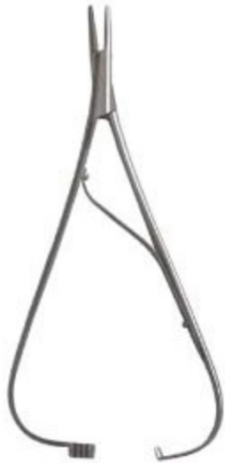
Mathieu Needle Holder V-3401- Stainless steel. 7",