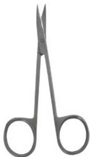
Iris Scissors - Curved V-2807-