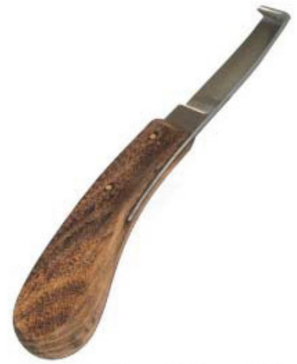
Narrow blade - right hand 3/8 V-2103-

Wooden handles, 3/8" narrow blade, left curved blade, stainless steel.