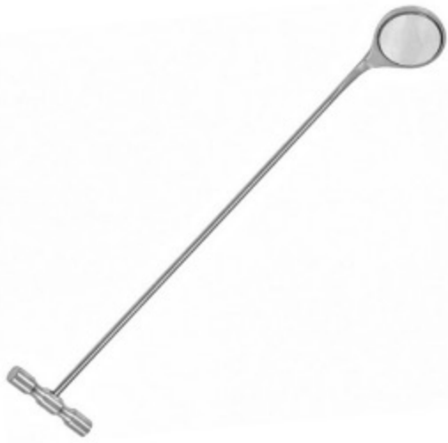
Sets With Carry Cases V-6113