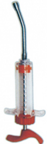
Birds Feeding Syringes 10,20,30,50ml V-4803