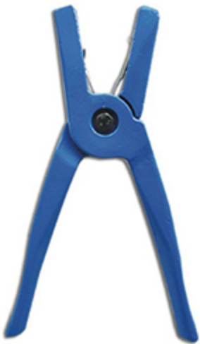
Ear Tag Plier Without Pin (size 9.5") 4504