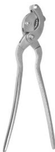
Serra Emasculator V-3614- Superior, modified, stainless steel 14",